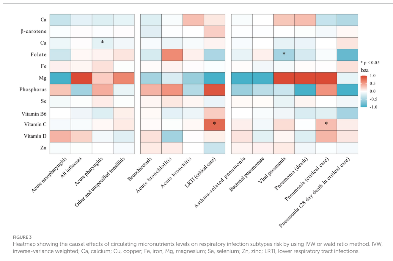
FIGURE 3 Heatmap showing the causal effects of circulating micronutrients levels on respiratory infection subtypes risk by using IVW or Wald ratio method. IVW, inverse-variance weighted; Ca, calcium; Cu, copper; Fe, iron; Mg, magnesium; Se, selenium; Zn, zinc; LRTI, lower respiratory tract infections.

( p < 0.05 ) involving three micronutrients and four infection subtypes. Specifically, there appeared to be suggestive causal relationships between genetically predicted serum Cu levels and acute pharyngitis (OR=0.855, 95% CI: 0.744 to 0.984, p = 0.029 , IVW), vitamin C and critical care admission with LRTI (OR=2.213, 95% CI: 1.129 to 4.338, p = 0.021 , IVW), vitamin C and critical care admission with pneumonia (OR=1.392, 95% CI: 1.030 to 1.882, p = 0.032 , IVW), and folate and viral pneumonia (OR=0.602, 95% CI: 0.368 to 0.982, p = 0.042 , IVW). Despite this, sensitivity analyses found no evidence of heterogeneity or pleiotropy (Supplementary Table S11), and these associations did not meet our stringent statistical threshold after the Bonferroni correction.